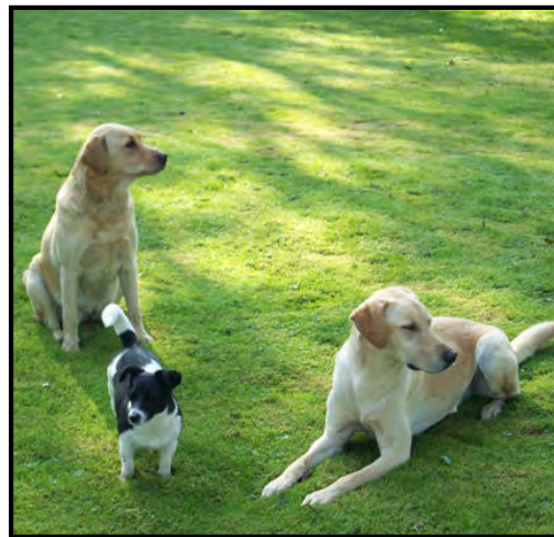
Jilly, Spookie and SHLR Frodo

How great for Safe Harbor to have Frodo as its overseas ambassador!